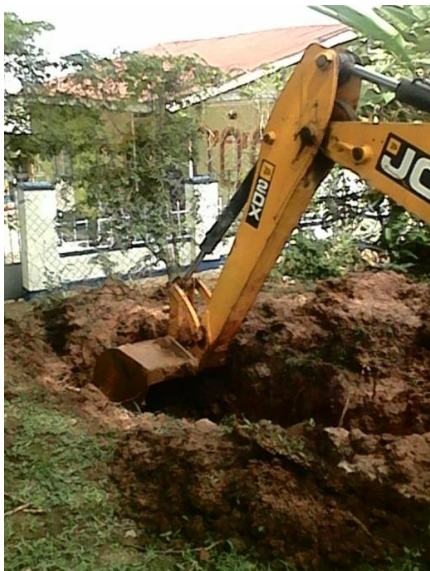
Leakage on DN 100 near Prince and Princess Kindergarten & daycare Namirembe. Network team responded.

With a 24hour call Centre and active social media accounts, NWSC gets timely updates on leakages, sewerage overflows and other network tasks. The teams on ground receive this information and perform their duties with skill and expertise.