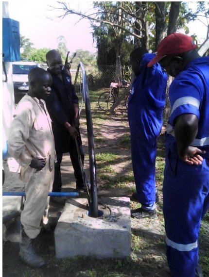
Water Stabilisation projects; NWSC team connects a newly drilled borehole in Apac