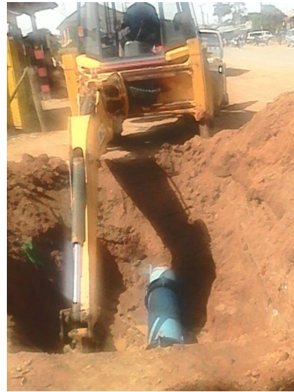
Burst on DN 300 along Namugongo road being repaired by the network team