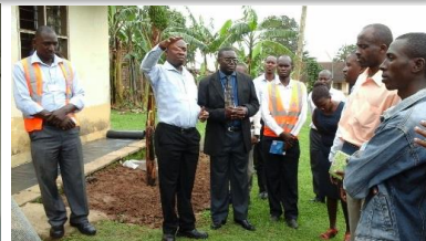
LEFT; GM addresses the Water production staff ABOVE; the launching of the rehabilitation of the staff quarters