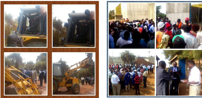
A pictorial sampling the Kyengera ground breaking event.