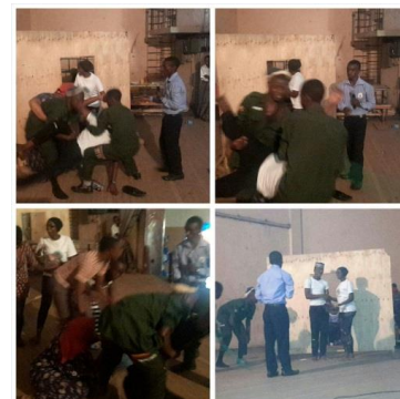
Right; the students play depicting an illegal Water user being arrested