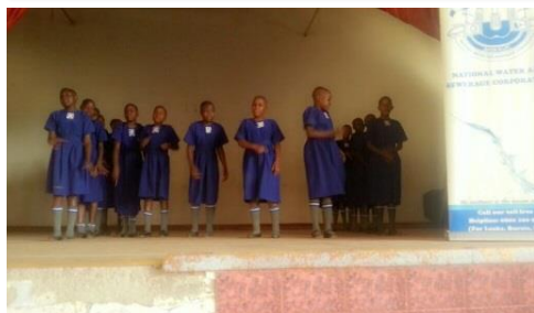
Above; Pupils of St Joseph's Primary present a poem on sanitation. Right; Students and Pupils present for the launch

Trinity College played host to the Zonal Launch of NWSC's School Water and Sanitation Clubs (SWAS), inviting schools from the area to the event. Some of the schools represented were St Lucia primary School and St Joseph's Primary School. The schools presented Poems, Songs and skits centered on good sanitation. Protection of water sources and water borne diseases.